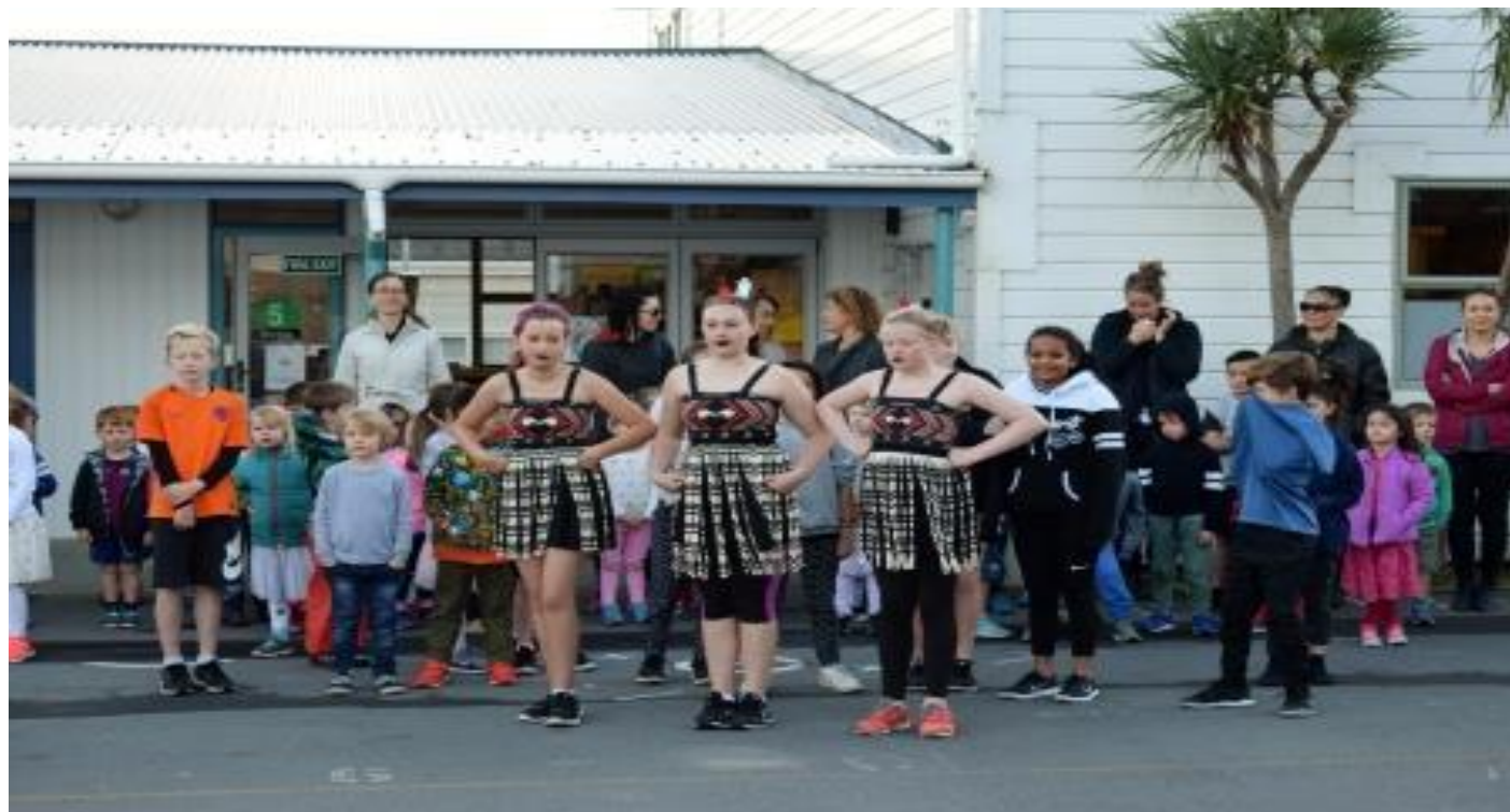
The school welcomed new whanau to Brooklyn School